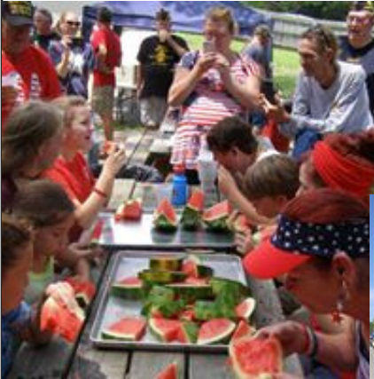
Watermelon eating contest at the 4th of July Picnic.

DEADLINE FOR NEXT NEWSLETTER IS DECEMBER 1ST.